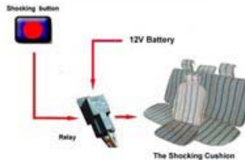
TPS-5 Protection Cushion